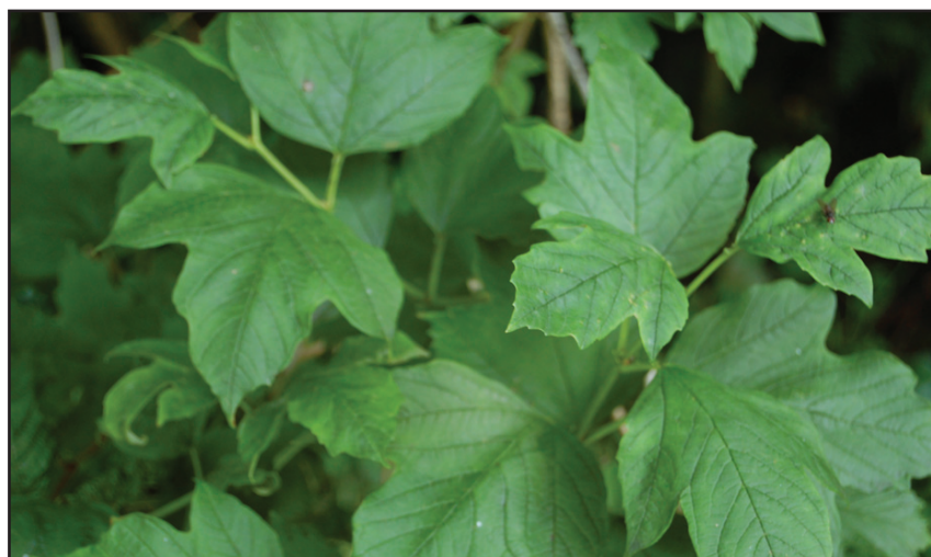
Guelder Rose with Maple like leaf.

Another Irish gem is the pure Yew woodland in Killarney, 60 acres of native Irish Yew grow at Reendandina on the Muckross peninsula – only a handful of such woodlands still exist in Europe. Rich in folklore and often